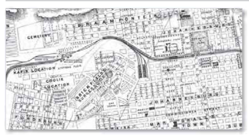
▲ Johannesburg, 1897.

A few steps away from the photograph of the miners, hangs one of the earliest maps of Johannesburg, published in 1897. It shows that, from the earliest days, the municipal authorities planned to keep the different racial groups apart. There are different areas clearly marked out for African, coloured, Indian and white residents.