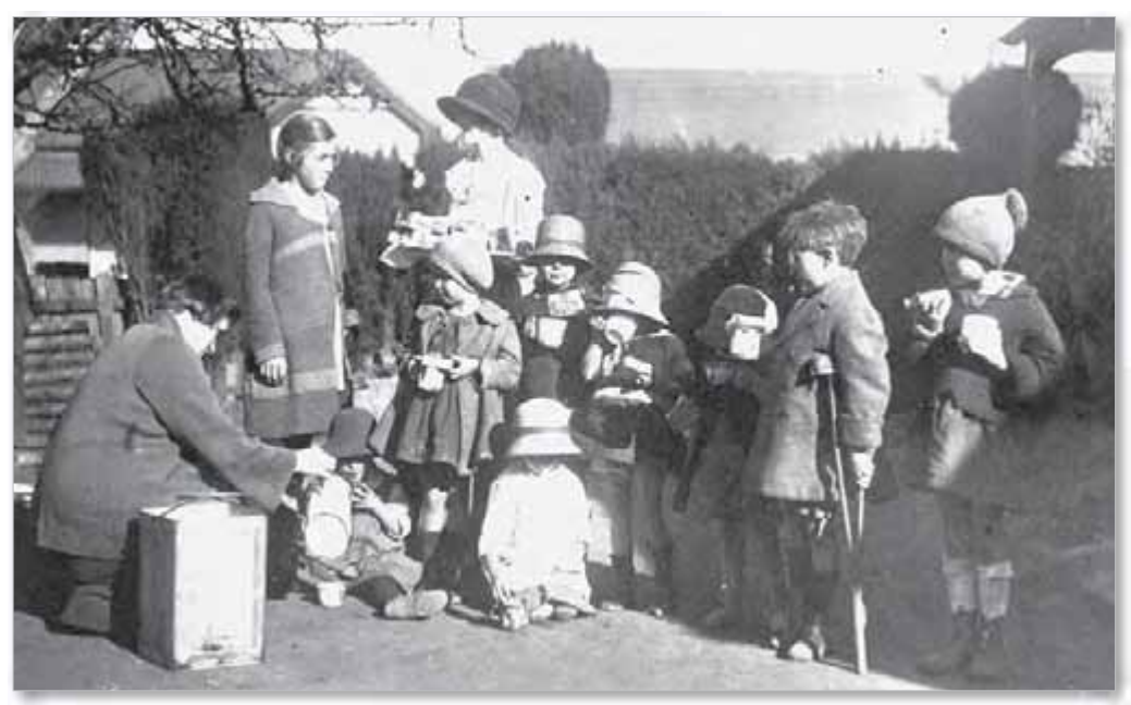
▲ A soup kitchen for poor whites in the 1930s.