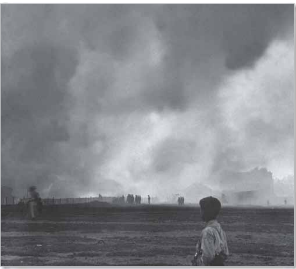
▲ The Apartheid Museum displays this photograph, which shows the burning down of the 'Coolie' Location.

The Africans who lived in the 'Coolie' Location were removed to Klipspruit. This was twenty kilometres outside of town and was to become the first suburb of Soweto many years later.