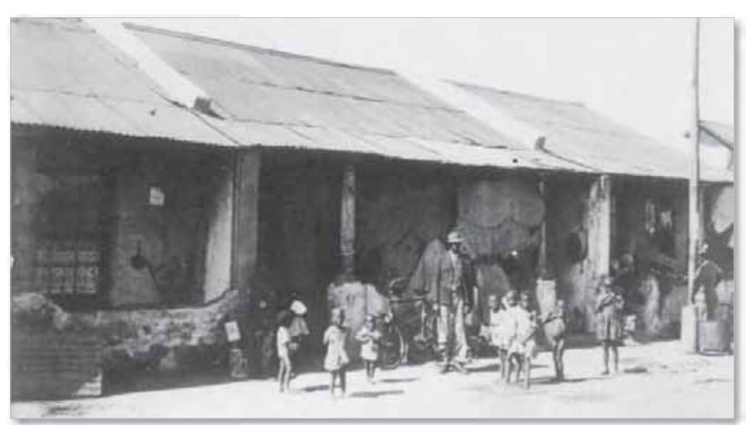
▲ New locations, such as Nancefield, were established to the south west of Johannesburg beyond the municipal boundaries.

Natives - men, women and children - should only be allowed in urban areas when their presence is demanded by the wants of the white population.