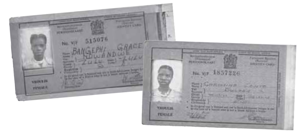
▲ The Apartheid Museum has on display a number of original passes and ID documents.

endorse out – when the authorities sign or place a stamp in a pass which forces a person to leave the urban area