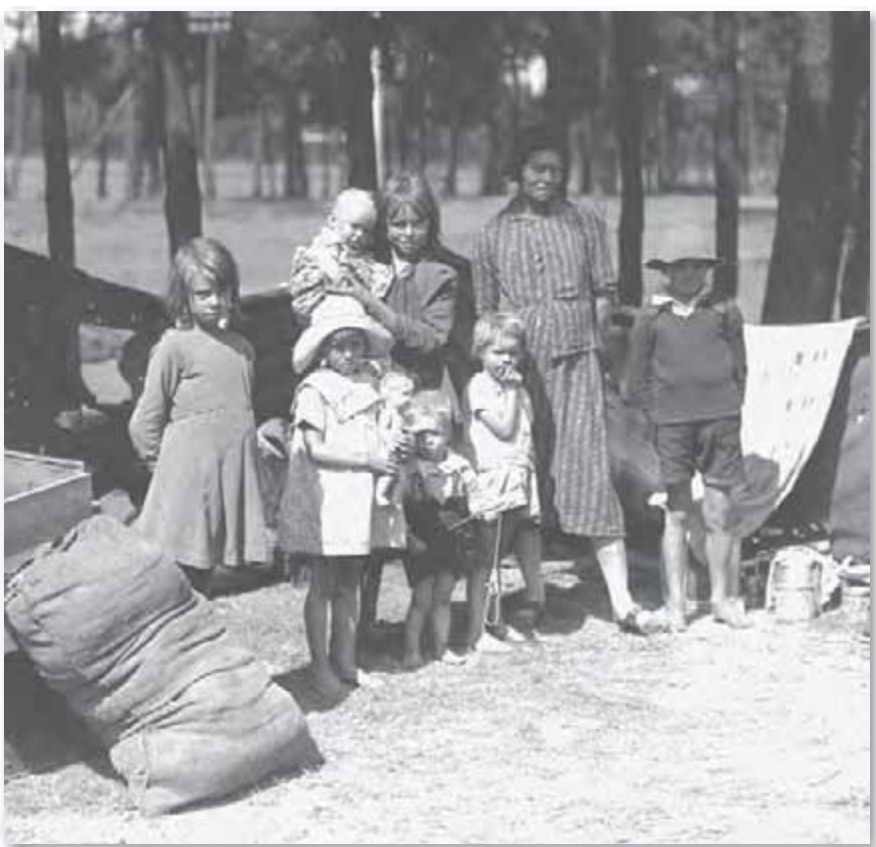
▲ Poor whites on the Rand in the 1930s.

Hertzog formed the Pact Government – a political alliance between his Afrikanerbased National Party and the Labour Party led by Colonel F.H.P. Creswell. Although these two parties had some different beliefs, they both disliked Smuts. They believed that Smuts and his South African Party (SAP) was not doing enough to protect white workers from losing their jobs to African workers.