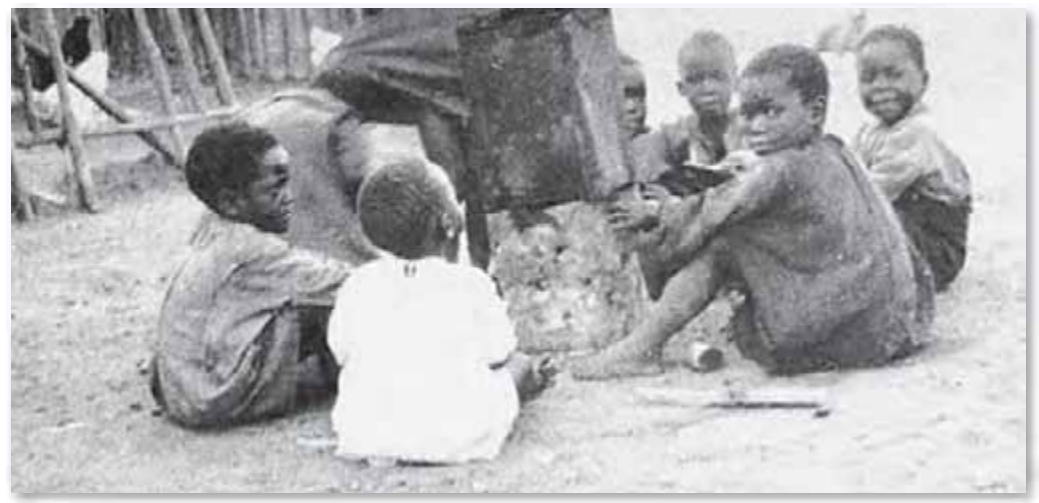
▲ The government gave African children no support during the Great Depression.

▲ Adapted from Working Life by L. Callinicos, Ravan Press, 1987, pp. 234-236.