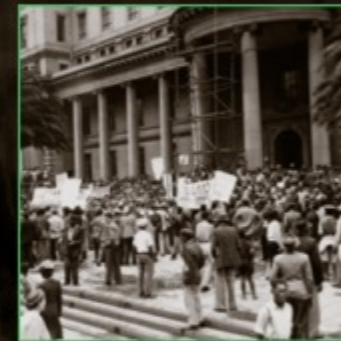
Mandela attended the Communist Party night school in Fox Street, where Harmel taught. He also accompanied him to Party protest meetings on the City Hall steps.